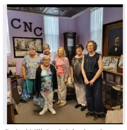
Retired Mill Creek School teachers toured the Museum. They loved the Central Normal College display!