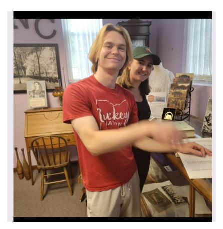
Students from the Ohio State University enjoyed learning about Central Normal College during their visit to the Hendricks County Historical Museum.