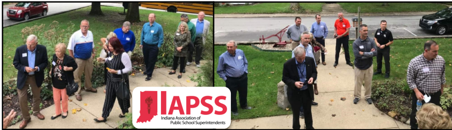
On October 7th the Museum was visited by 30 members of the Northern Indiana Superintendent's Club. Thanks for stopping by!!

We currently pay almost $900 a year sending out the newsletter.