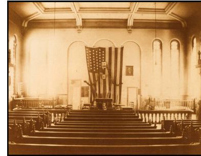
Hendricks County Courthouse, 1862-1912, Danville

Are you interested in agriculture, architecture, disasters? Search the collection by topic or scroll through each photograph. Take a walk back through history and enjoy! As we add to the content, this collection will continue to grow. Additionally, the Indiana Memory Project is now a part of the Digital Public Library of America. This collaboration will increase awareness of the Hendricks County Museum by making our digital historic photographs easily accessible and free to a broader audience.